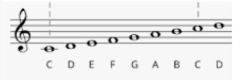
Notes on the treble clef staff