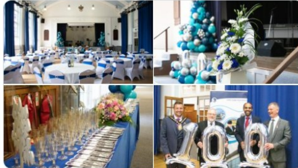
10:22 AM · Jul 7, 2022 · Twitter Web App

Thow back to last week, our #Centenary meal was such a lovely community celebration, learning what our school means to so many people. #History #Smethwick #Community