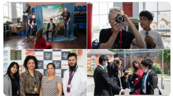
4:17 PM · Jul 6, 2022 · Twitter Web App

Massive thanks to @CanonEMEA for the workshop, teaching our students about #photography as part of the @birminghamcg22 #CommonwealthGames