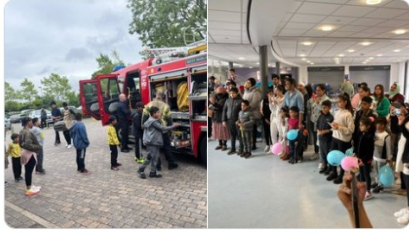
2:23 PM · Jul 3, 2022 · Twitter Web App

We had such a great time at our fun day yesterday! #Centenary #FunDay #Smethwick #Community