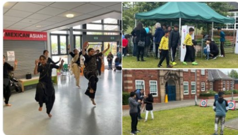
2:24 PM · Jul 3, 2022 · Twitter Web App

Thank you to everyone who visited us yesterday for our #community fun day.