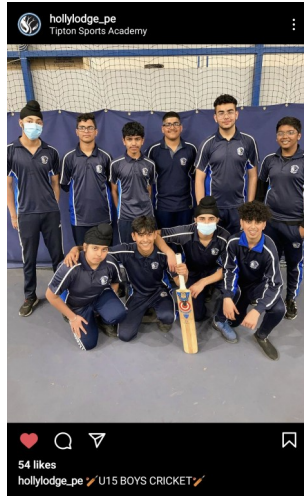
54 likes hollylodge_pe U15 BOYS CRICKET