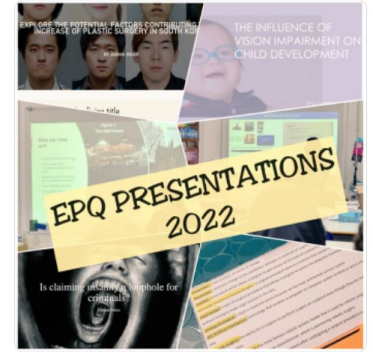
5:10 PM · Apr 4, 2022 · Twitter for Android

Our EPQ Class of 2022 gave their presentations today. Amazing job by all involved with some very interesting topics. A special thanks as well to all the staff who managed to pass through in support. #Ambition