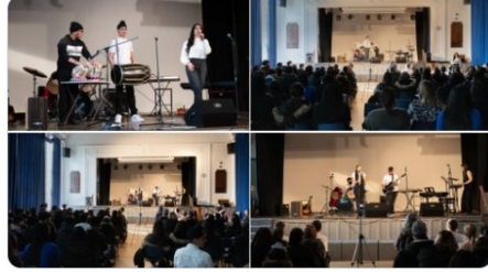
9:12 AM · Mar 25, 2022 · Twitter Web App

WOW WOW WOW, last night our Y11 btec Music students gave a performance as part of their course. They also arranged the show as well as performing! Just brilliant. 🎸🎤🎶 #music #performing #opportunity