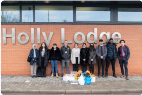
12:40 PM · Apr 5, 2022 · Twitter Web App

With thanks to our Y12 Food Bank reps pictured here with just some of the donations collected from Y7 students. These items were taken to Salma Food Bank. Our collections will continue after Easter. Thank you for your donations. #Community #Smethwick #FoodBank