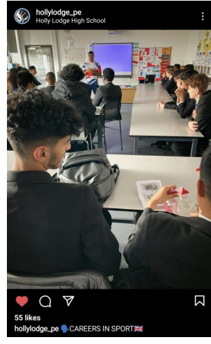
55 likes hollylodge_pe CAREERS IN SPORT